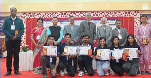
Felicitations Ceremony of National Level Smart India Hackathon Grand Finale-2024