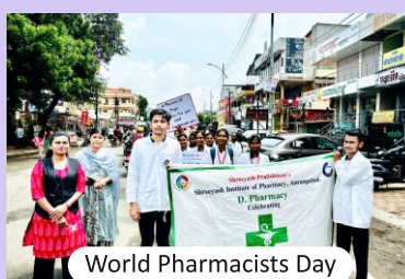
World Pharmacists Day