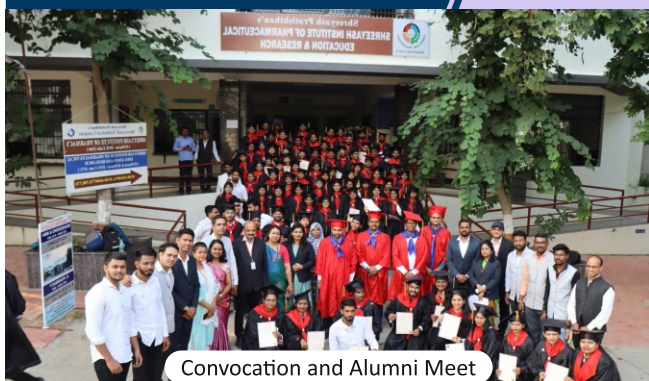
Convocation and Alumni Meet