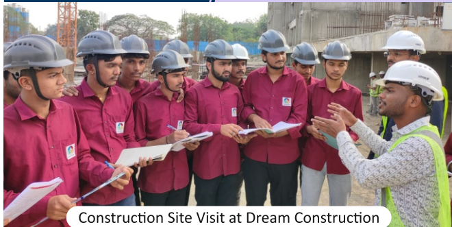
Construction Site Visit at Dream Construction