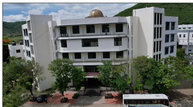
SYIPER : SHREEYASH INSTITUTE OF PHARMACEUTICAL EDUCATION & RESEARCH (INSTITUTE CODE : 2572)