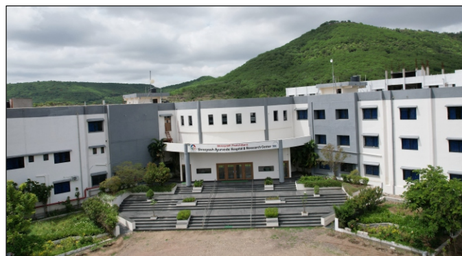
SHREEYASH AYURVEDIC HOSPITAL & RESEARCH CENTER