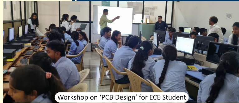
Workshop on 'PCB Design' for ECE Student