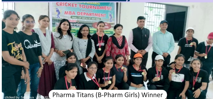
Pharma Titans (B-Pharm Girls) Winner