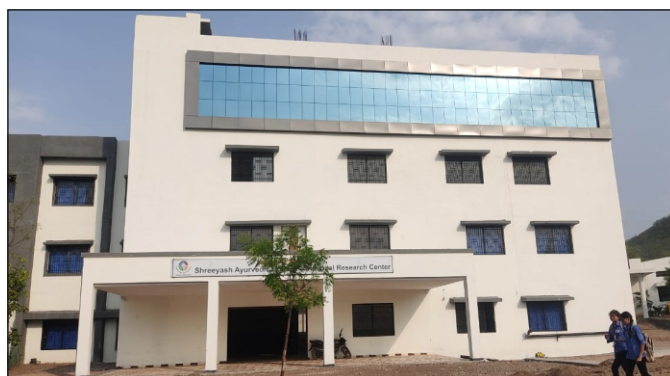
SHREEYASH AYURVEDIC COLLEGE & HOSPITAL RESEARCH CENTER