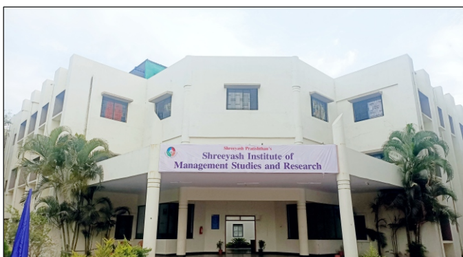
SIMSR : SHREEYASH INSTITUTE OF MANAGEMENT STUDIES & RESEARCH (INSTITUTE CODE: 2623)