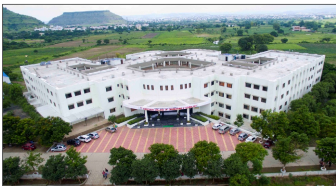
SYCET : SHREEYASH COLLEGE OF ENGINEERING & TECHNOLOGY / MBA (INSTITUTE CODE : 2112)