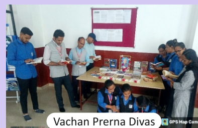
Vachan Prerna Divas